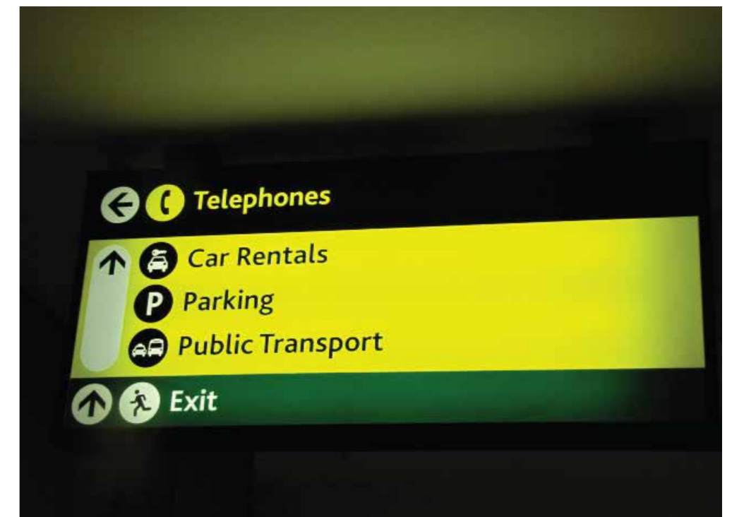
Follow the yellow directional signage towards Parkade 1