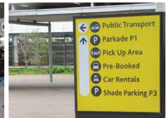
Exit out of the sliding doors in the main lobby next to CNA. Keep on following the yellow directional signage.