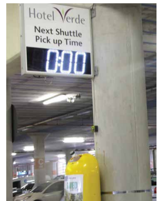
You're almost there! Keep following the signage. Enter Parkade 1, walk down the slope and turn right into the corridor. Look out for the Hotel Verde clock where our driver will pick you up.